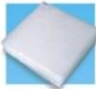
Labels UN3373 (category B)