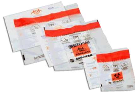
STP-109 & 110